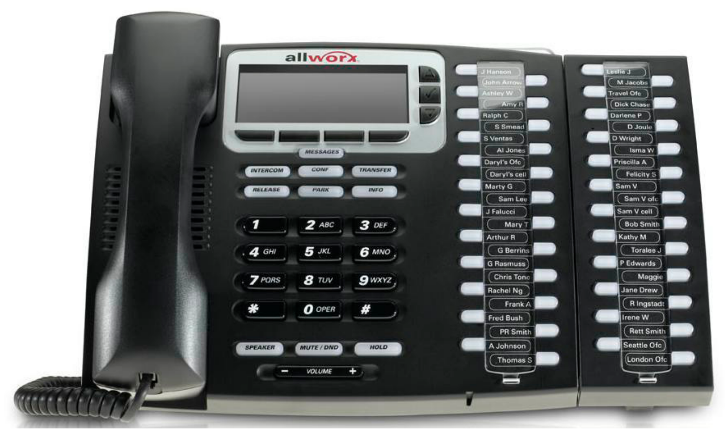
Tx 92/24 Telephone Expander connected to the 9224 Phone

A power supply is not included. The connected phone provides power to the telephone expander.